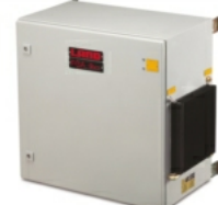
Combustion Efficiency Monitors