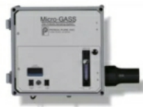
Gas Analyzers and Analytical Devices