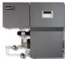
Chlorine Dioxide Analyzer