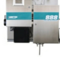
Sulfur Recovery Unit Analyzers

On-line process analyzers for the compositional analysis of gas and liquid sample streams