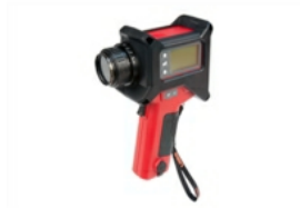
Portable Non-Contact Thermometers