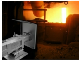
Fixed Thermal Imagers & Line Scanners