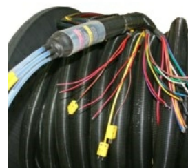
Clayborn Lab Heated Tape, Heated Sample Lines