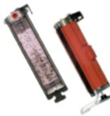
Gas Sample Conditioning Systems for Emissions and Process Monitoring