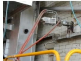
Thermal Imaging Borescopes