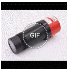
Fixed Spot Non-Contract Thermometers / Pyrometers

Leading manufacturer of cutting-edge instrumentation and analyzers designed for non-contact industrial infrared temperature measurements, combustion efficiency assessment, and environmental pollutant emissions monitoring