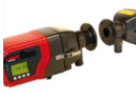
Opacity and Dust Monitors