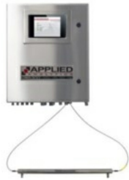
Wall Mounted OMA-3==

global manufacturer of industrial process analysis instruments