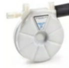
Gas Drying & Humidification